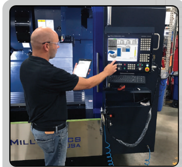
DSA uses Wi-Fi to make a cell phone or tablet an extension of the user's control.